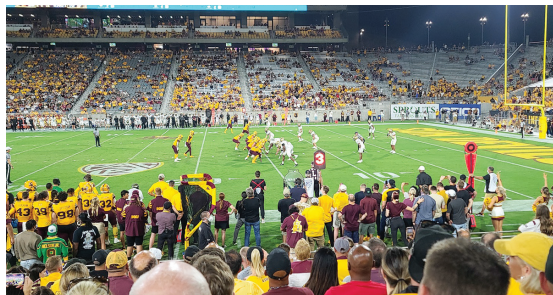
3rd down stoppages were common as the Sun Devils continually stopped the Buffaloes' advance with their fantastic defense.