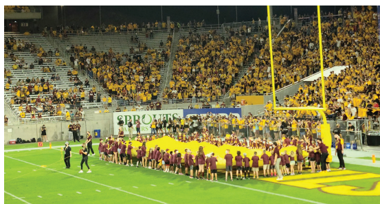
Sun Devil students waved the flag before the players stepped on the field.