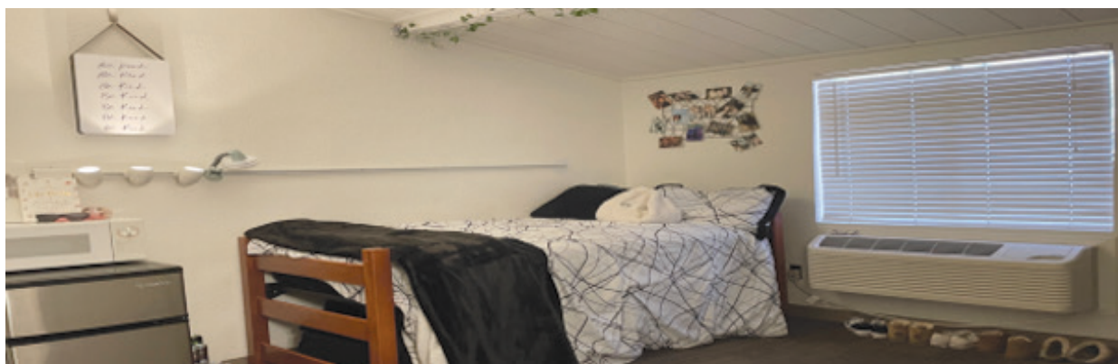
A Residence Hall dorm room at Arizona State University at Lake Havasu City

ASU at Lake Havasu has a hidden treasure just feet away from the campus, the residence hall! The residence hall provides a quick walk to class, a comfortable living space, a laundry room, a common room with a kitchen, and becoming neighbors with your best friends.